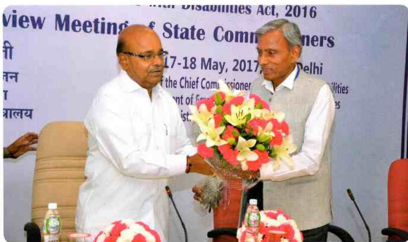
Chief Commissioner for Persons with Disabilities (Divyangjan), welcoming Hon'ble Union Minister Shri. Thaawarchand Gehlot, Ministry of Social Justice Empowerment on 15 th National Review Meeting of State Commissioners for Persons with Disabilities on 17-18 th May 2017 at Vigyan Bhawan, New Delhi