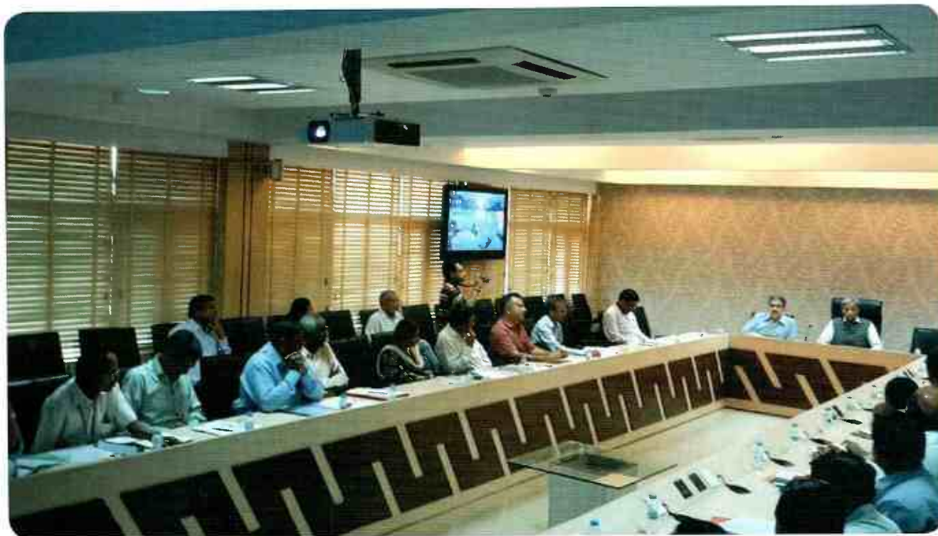
Chief Commissioner for Persons with Disabilities (Divyangjan), during State Review Meeting at Gandhinagar in Gujrat