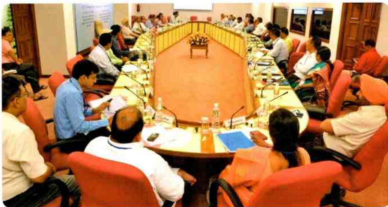
State Commissioners Participants 15th National Review Meeting at Vigyan Bhawan New Delhi