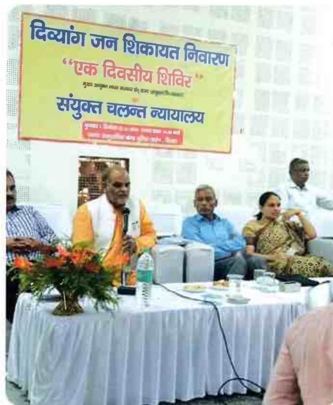
Chief Commissioner for Persons with Disabilities (Divyangjan), during Joint Mobile Court at Sirsa in Haryana