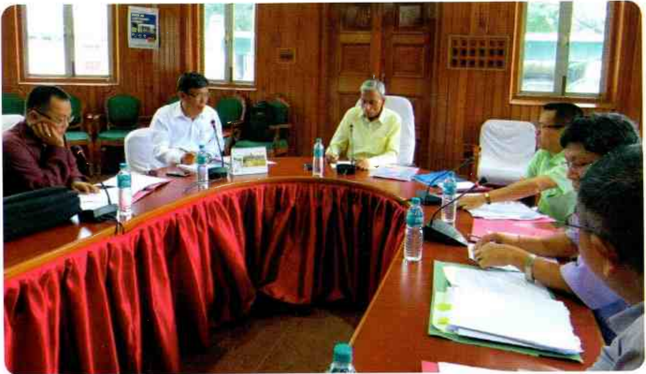
Chief Commissioner for Persons with Disabilities (Divyangjan), during State Review Meeting at Imphal in Manipur.