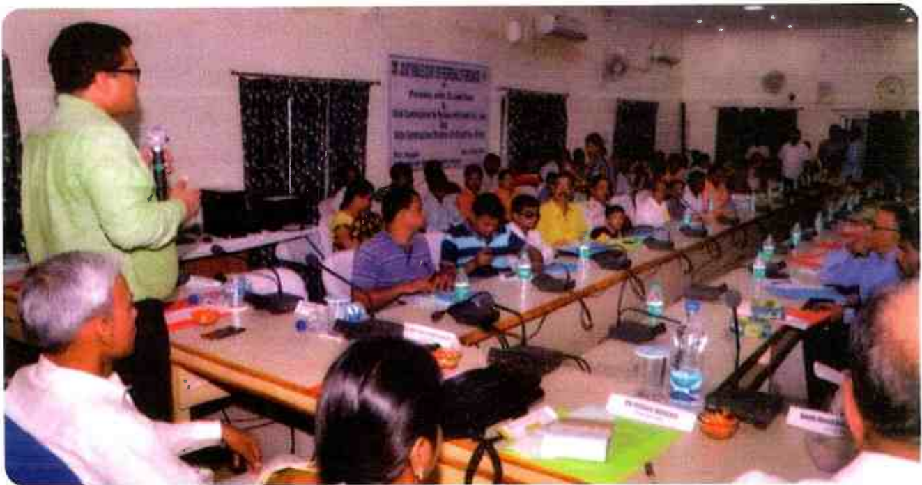
Chief Commissioner for Persons with Disabilities (Divyangjan), during Joint Mobile Court at Nayagarh in Odisha