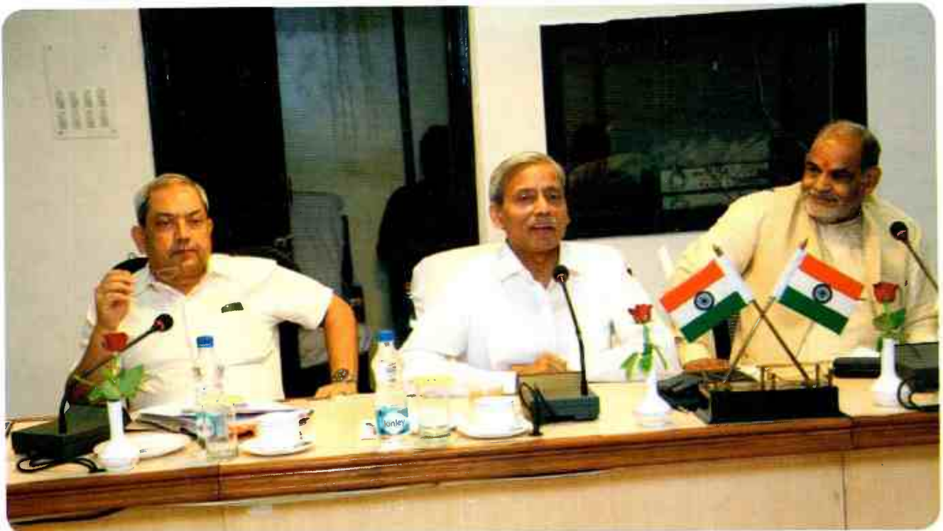
Chief Commissioner for Persons with Disabilities (Divyangjan), during State Review Meeting at Chandigarh in Haryana