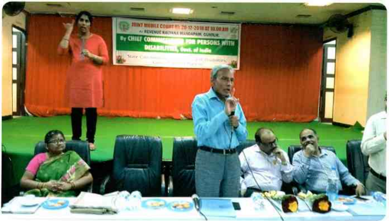
Chief Commissioner for Persons with Disabilities (Divyangjan), during Joint Mobile Court at Guntur in Andhra Pradesh