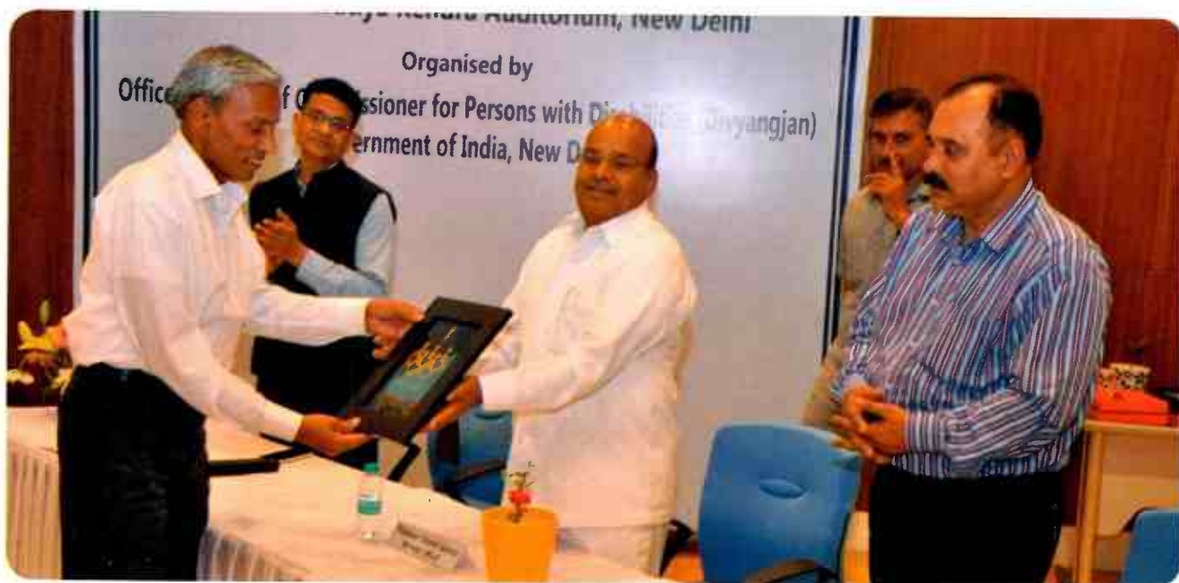
CCPD Presenting the Memento to Sh. Thaawarchand Gehlot, Hon'ble Minister for Social Justice and Empowerment Seminar on "Challenges in Implementation of Rights of Persons with Disabilities Act, 2016" on 16 th March 2017 organized by Office of Chief Commissioner Persons with Disabilities (Divyangjan)