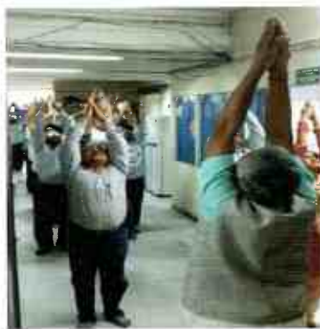
Chief Commissioner & Officers/Employees of the Office of the CCPD (Divyangjan) Observing in Yoga Day on 21st June 2017