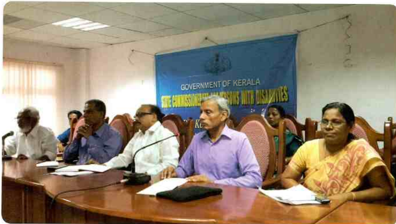
Chief Commissioner for Persons with Disabilities (Divyangjan), during State Review Meeting at Thiruvananthapuram in Kerala