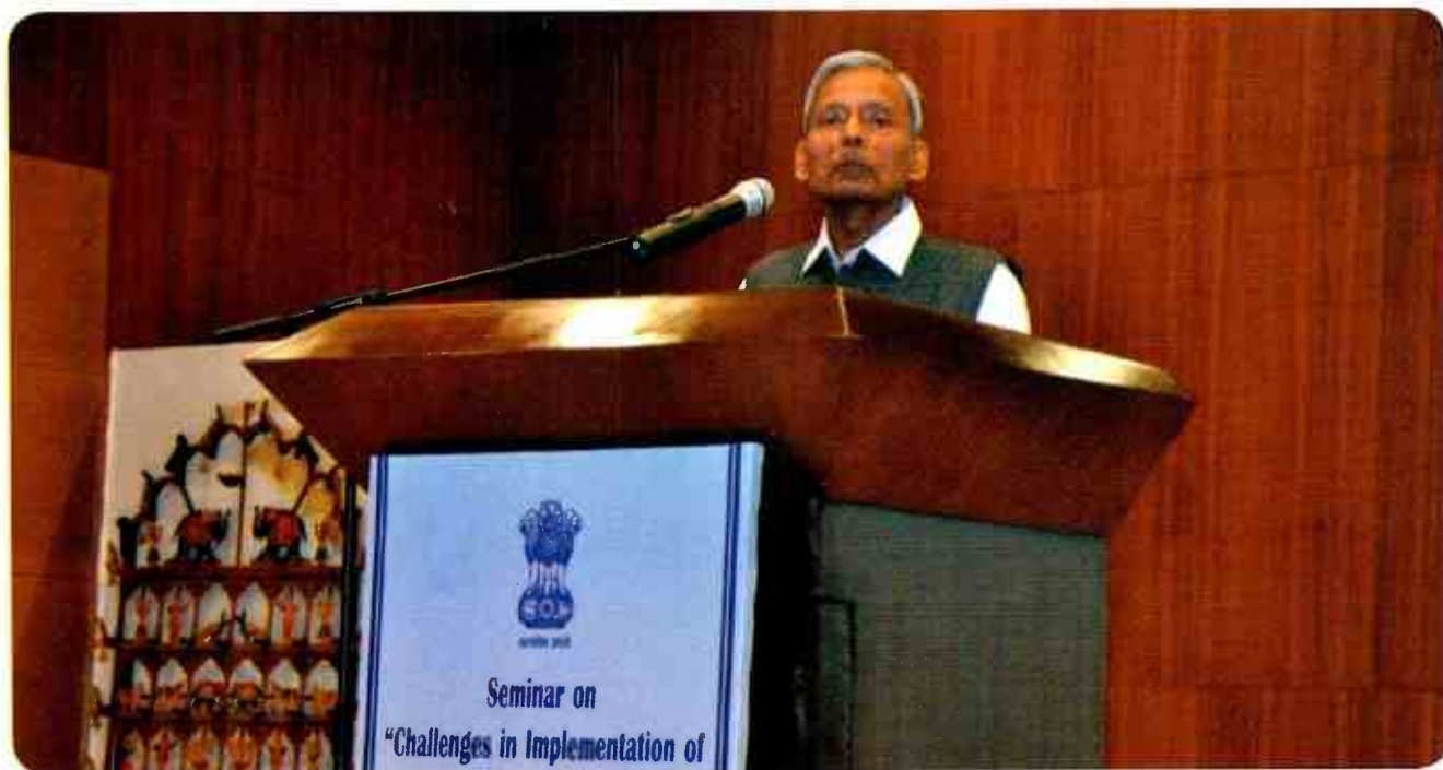
Chief Commissioner for Persons with Disabilities (Divyangjan) addressing at Seminar on "Challenges in Implementation of Rights of Persons with Disabilities Act, 2016" on 16 th March 2017, organized by Office of Chief Commissioner Persons with Disabilities Divyangjan at Pravasi Bharatiya Kendra, Chanakyapuri, New Delhi