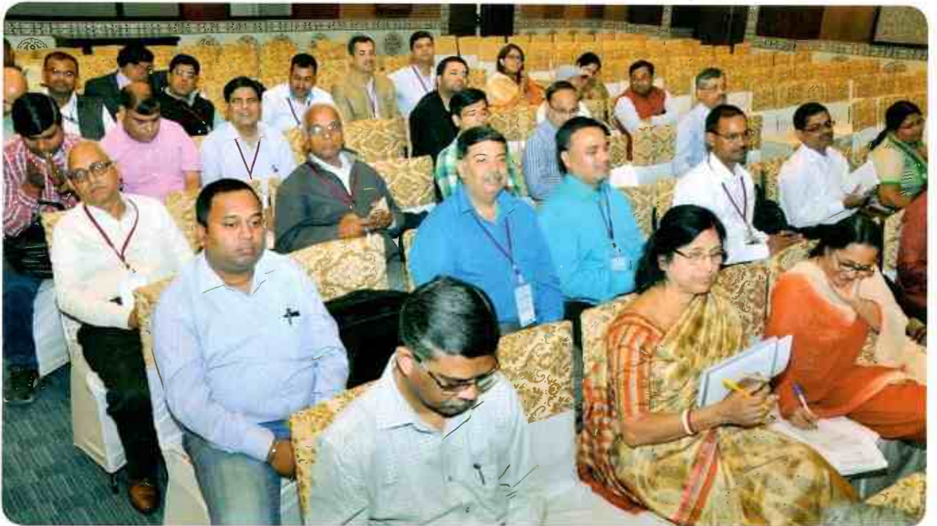
Participants at the Seminar on "Challenges in Implementation of Rights of Persons with Disabilities Act, 2016" on 16 th March 2017, at Pravasi Bharatiya Kendra, Chanakyapuri, New Delhi