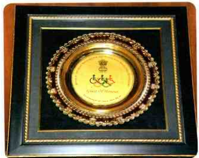
Seminar on "Challenges in Implementation of Rights of Persons with Disabilities Act, 2016" 16 th March 2017, organised by Office of the Chief Commissioner Persons with Disabilities Divyangjan at Pravasi Bharatiya Kendra, Chanakypuri, New Delhi