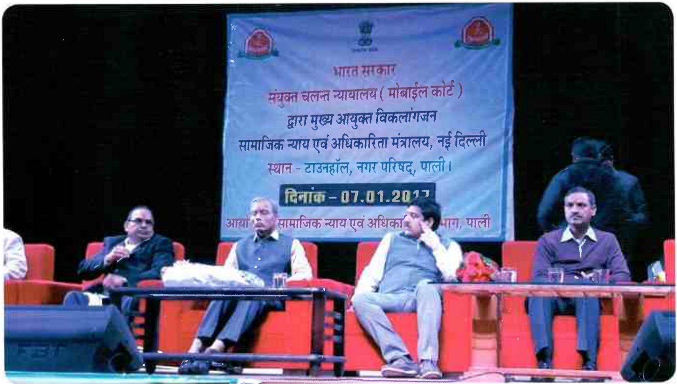
Chief Commissioner for Persons with Disabilities (Divyangjan), during Joint Mobile Court at Pali in Rajasthan