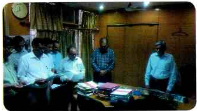
Observance of Vigilance Awareness week at CCPD Office- Pledge being administered by Chief Commissioner for Persons with Disabilities (Divyangjan)