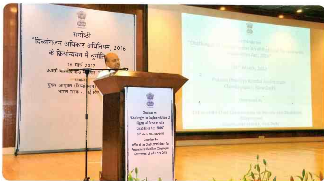
Sh. Thaawarchand Gehlot, Hon’ble Minister for Social Justice and Empowerment addressing the Seminar on “Challenges in Implementation of Rights of Persons with Disabilities Act, 2016” 16 th March 2017, organized by Office of the Chief Commissioner Persons with Disabilities (Divyangjan)

The Chief Commissioner for Persons with Disabilities (Divyangjan) has to play an important role in the implementation of the act, therefore,