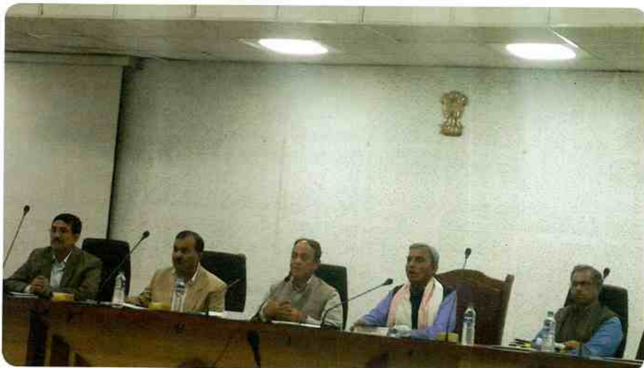
Chief Commissioner for Persons with Disabilities (Divyangjan), during State Review Meeting at Guwahati in Assam