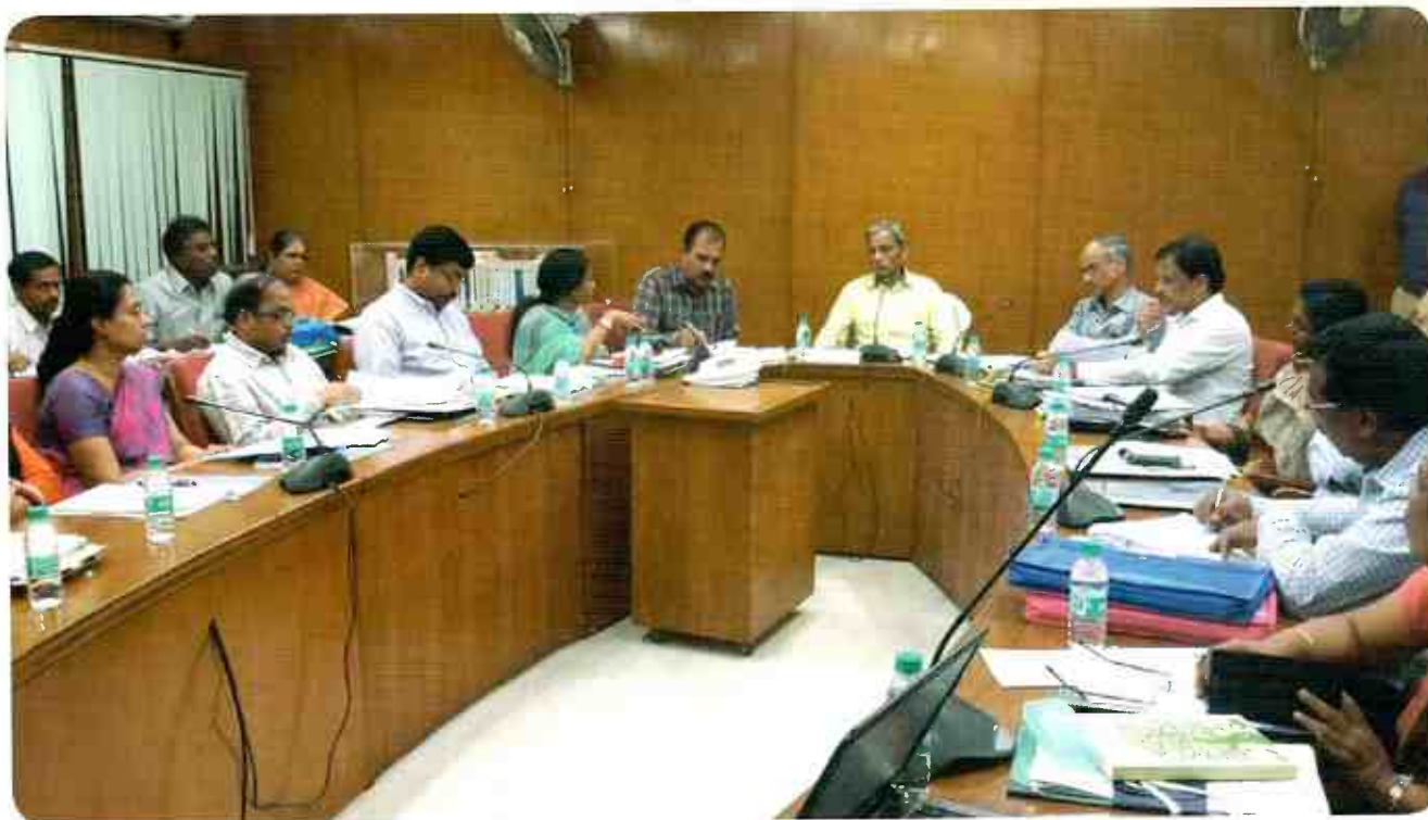
Chief Commissioner for Persons with Disabilities (Divyangjan), during State Review Meeting at Tamilnadu in Chennai