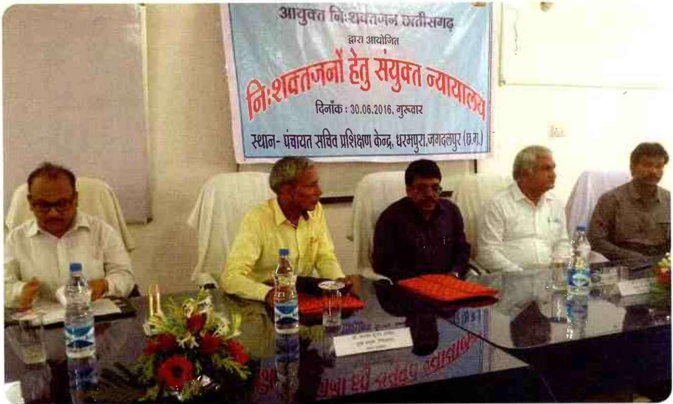
Chief Commissioner for Persons with Disabilities (Divyangjan), during Joint Mobile Court at Jagdalpur in Chhatisgarh